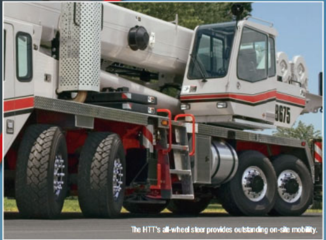
The HTT's all-wheel steer provides outstanding on-site mobility.